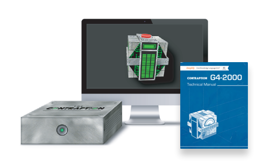
Quest for the Core: The Contraption (1)