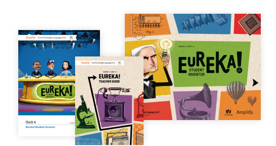
Quest for the Core: Eureka! Student Inventor (1)