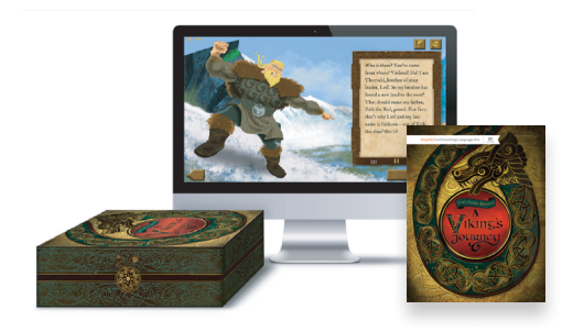
Quest for the Core: Far From Home: A Viking's Journey (1)