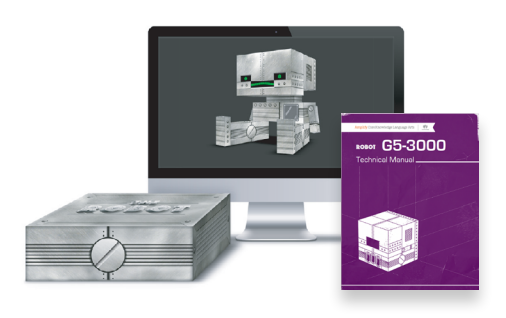
Quest for the Core: The Robot (1)